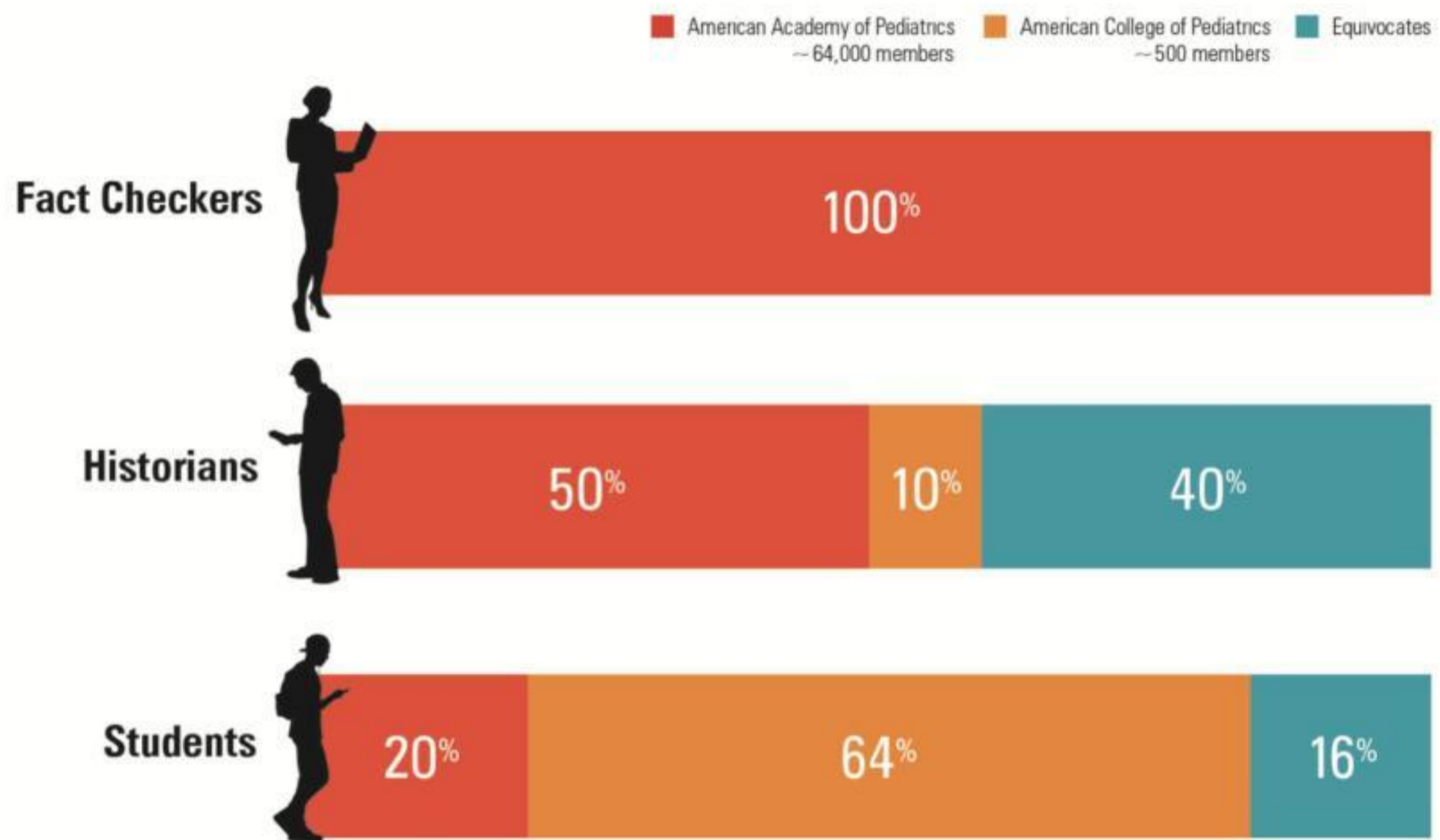
Figure 1. Percentage of participants in each group selecting the College or the Academy as more reliable.